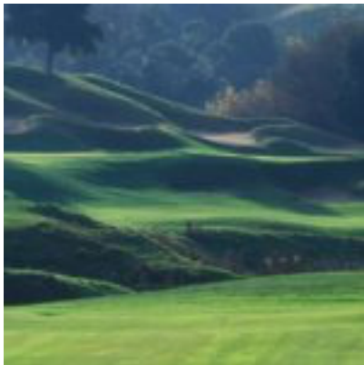
Hiddenbrooke Golf Club

Purgatory Golf Club is an unusual moniker for a course that has actually been blessed by a priest! Located in Noblesville, Indiana, less than an hour from Indianapolis, this is a family-owned business and one of the more popular daily-fee courses in the area surrounding the capital city. Designed by local architect Ron Kern, Purgatory can play as one of the longest (7,754 yards) courses in Indiana and features more than 125 bunkers and acres of tall native grasses. Spread across more than two hundred acres of memorable terrain, the signature hole is a mid-length, par-3 dubbed “Hell’s Half Acre” that features a green guarded by two acres of bunkers. Purgatory has been ranked amidst Golf Digest Magazine’s “America’s 100 Greatest Public Courses.”