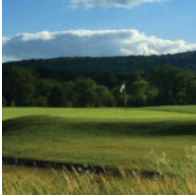
Wintonbury Hills Golf Course

It's been rumored that World Golf Hall of Fame member Pete Dye, one of the finest course architects of the last century, designed Wintonbury Hills for a dollar. It was Dye's way of giving back to the game he loves, and producing a high-quality municipal course in an area that was lacking. The only design he's ever produced in the six New England states, this Bloomfield (outside of Hartford) Connecticut gem is perennially ranked among the finest municipal courses in the nation. Plenty of permitting hurdles had to be jumped, as the course wends its way through more than eighty acres of woods and wetlands. The end result is a walkable, old-school experience, with a nice balance of holes that are open and tree-lined. There are some nice water views sprinkled throughout, including the nearby Tunxis Reservoir.