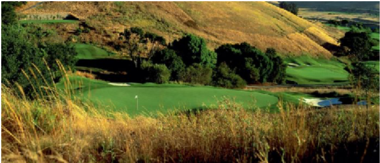
Hiddenbrooke Golf Club

Pop Quiz: Who has won the most points in U.S. Ryder Cup history? No—not Jack Nicklaus or Arnold Palmer, though they are near the top. Certainly not Phil or Tiger; their era coincides with the European dominance of recent decades, and these two leading money-winners in PGA Tour history actually have mediocre records in the biennial competition. (True Fact: Tiger and Phil have more losses than any other American players in the entire history of the Ryder Cup. Tiger with seventeen, Phil nipping at his heels with sixteen!)