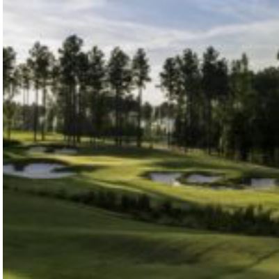
Magnolia Green Golf Club

Beach and Spyglass Hill. That's the level of quality that this underrated facility offers a grateful public.