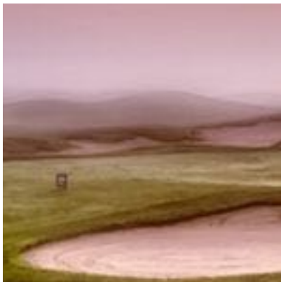
Purgatory Golf Club

It's been rumored that World Golf Hall of Fame member Pete Dye, one of the finest course architects of the last century, designed Wintonbury Hills for a dollar. It was Dye's way of giving back to the game he loves, and producing a high-quality municipal course in an area that was lacking. The only design he's ever produced in the six New England states, this Bloomfield (outside of Hartford) Connecticut gem is perennially ranked among the finest municipal courses in the nation. Plenty of permitting hurdles had to be jumped, as the course wends its way through more than eighty acres of woods and wetlands. The end result is a walkable, old-school experience, with a nice balance of holes that are open and tree-lined. There are some nice water views sprinkled throughout, including the nearby Tunxis Reservoir.